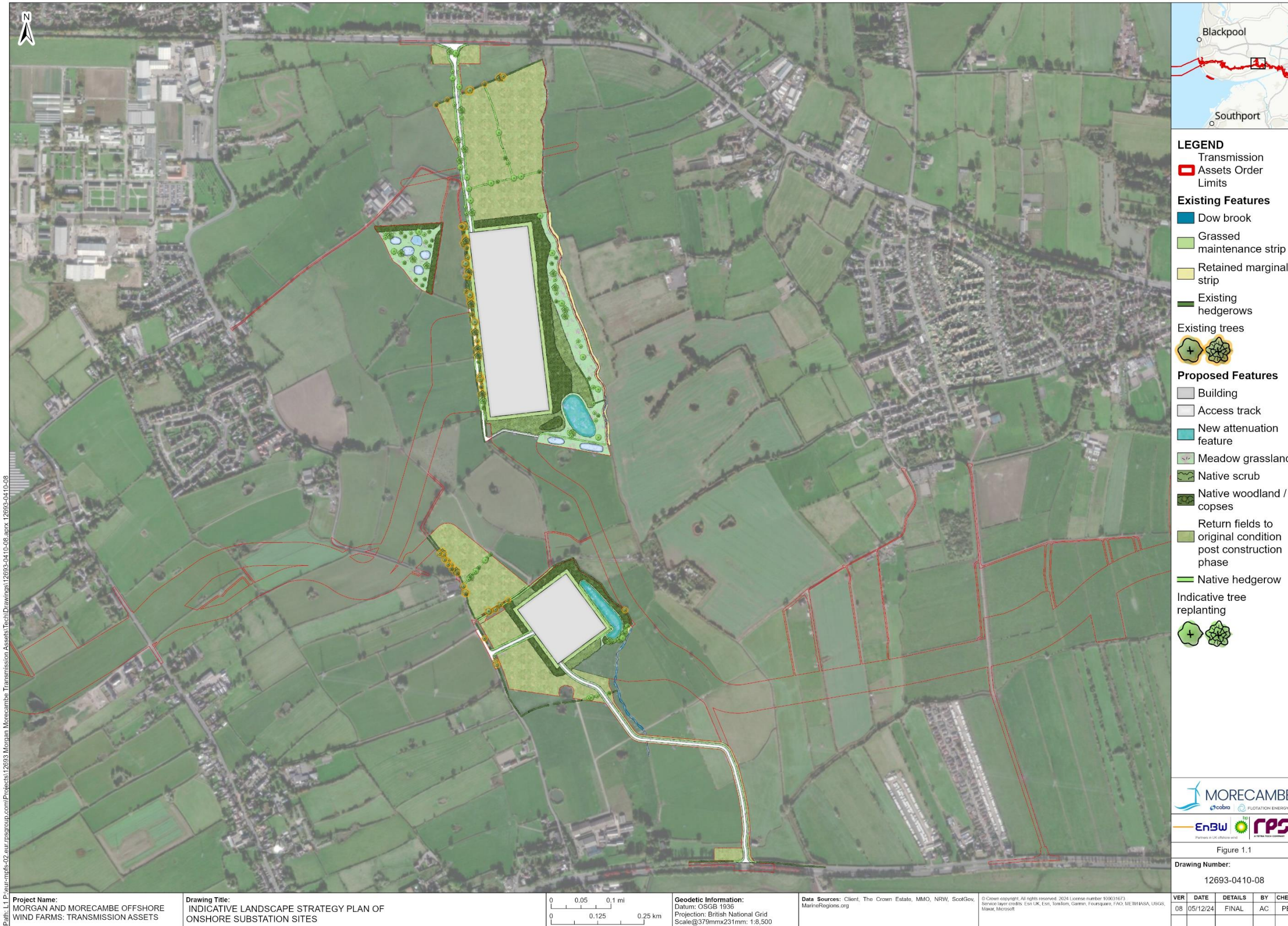
Figure 1.1: Indicative landscape strategy plan of onshore substation sites